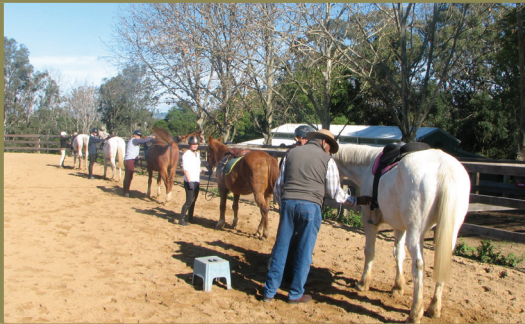
FIGURE 4 Line up for mount