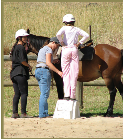
FIGURE 14 Mounting