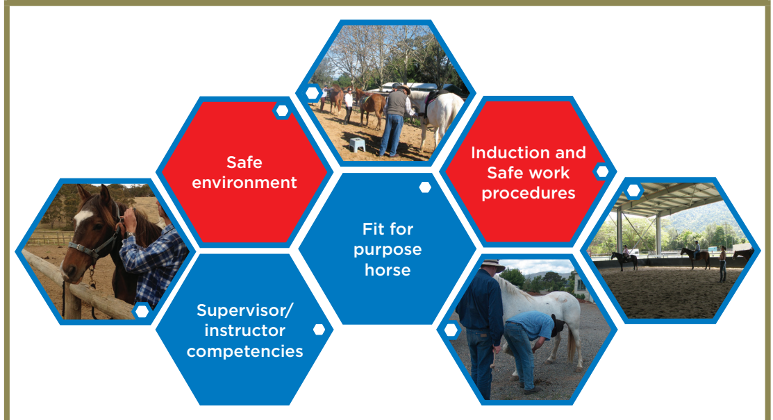
FIGURE 1 Key aspects of managing risks