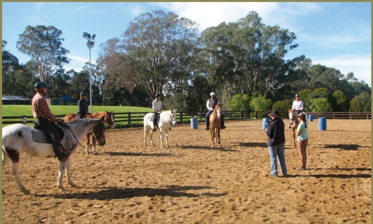
FIGURE 5 Instructor training