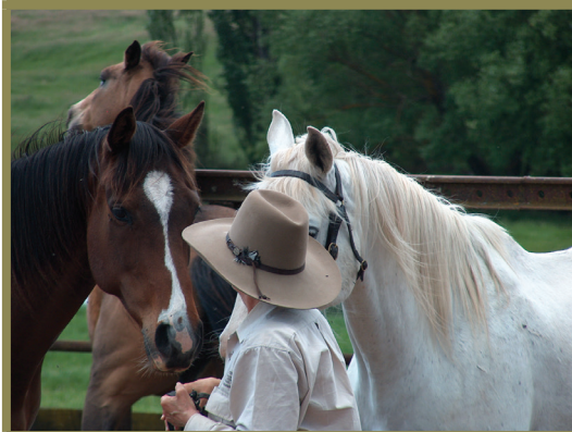
FIGURE 13 Catching a horse in a group