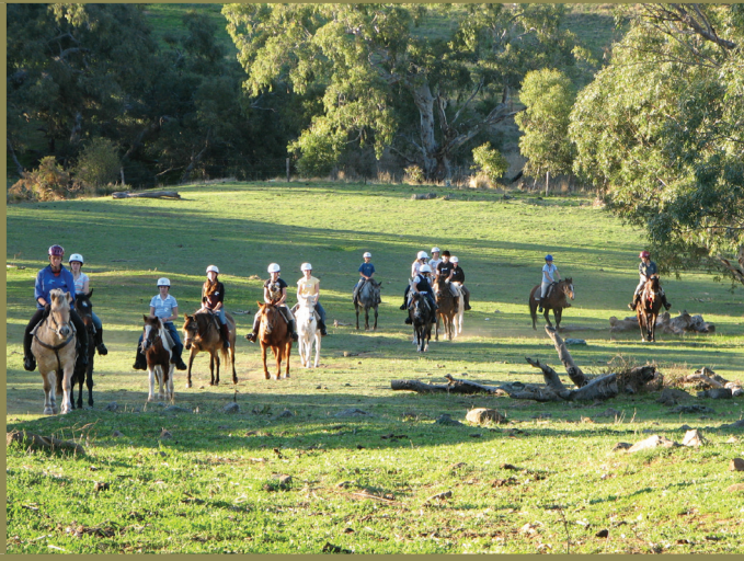
FIGURE 8 Riding in the open