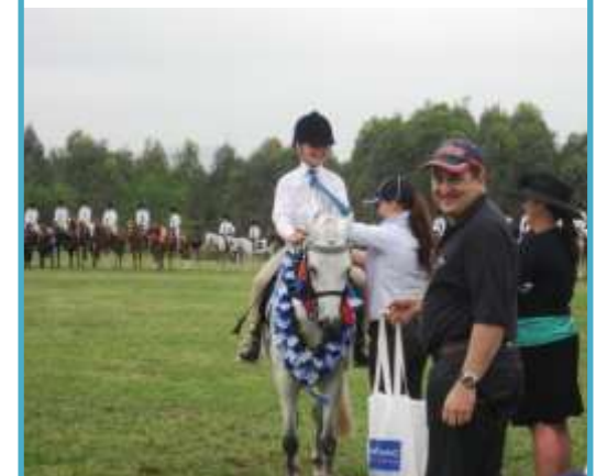
State Championship presentation ceremony