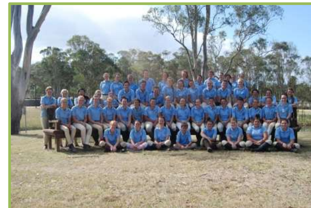
State Camp article in 'The Land' Newspaper