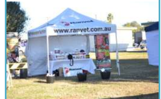
State Championship sponsor trade stand