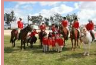
Forbes Pony Club