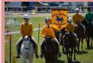
North Dorrigo Pony Club