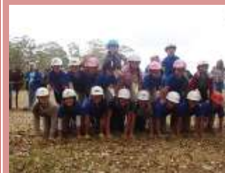
Hastings District Pony Club