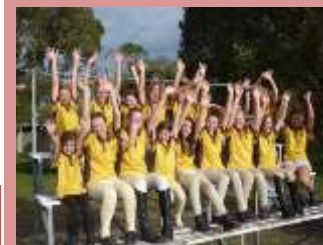
Cabarita Beach Pony Club